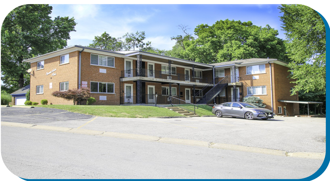
Located in the vibrant Webster Groves district, walkable to Webster University and near plenty of restaurants and shops!